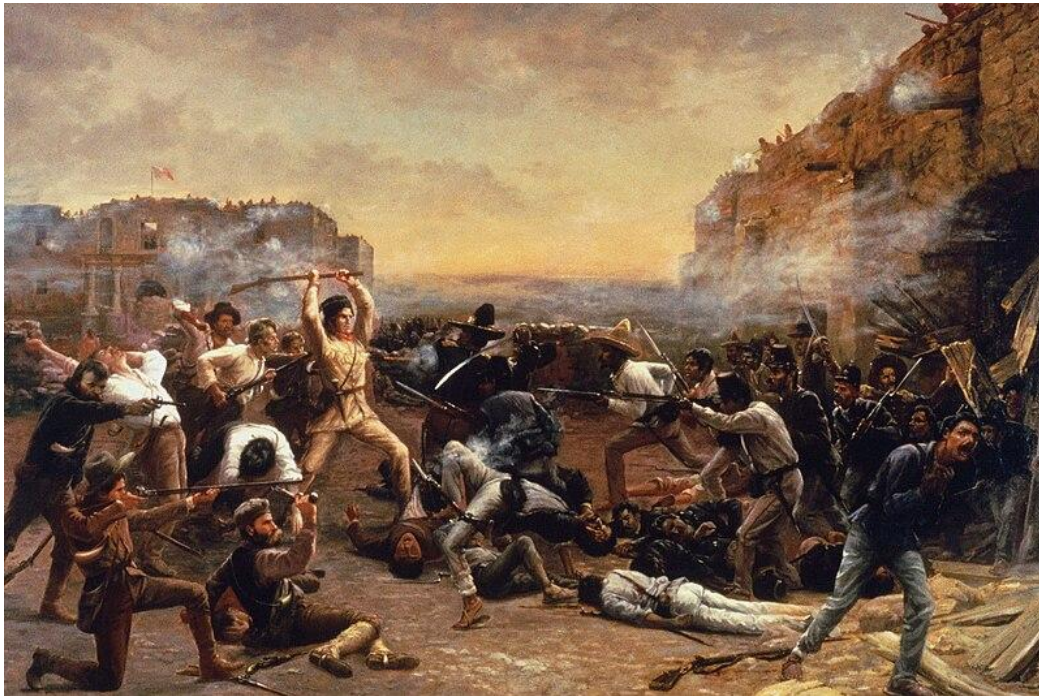
The Fall of the Alamo by Robert Jenkins Onderdonk

I feel much the same whenever I visit the Alamo, in San Antonio, Texas. The city has grown and enveloped small Mission San Antonio de Valero, that 200 Texian defenders turned into a fortress and held against overwhelming odds for 13 days in 1836. All but one of them would die there. There's a sacred feel to the place, bought and paid for through the embrace of great suffering and sacrifice. One can easily imagine Colonel William Barrett Travis, near the end of the siege, drawing his iconic line in the sand with his saber and inviting the men of the small garrison to cross the line and join him in fighting to the death.